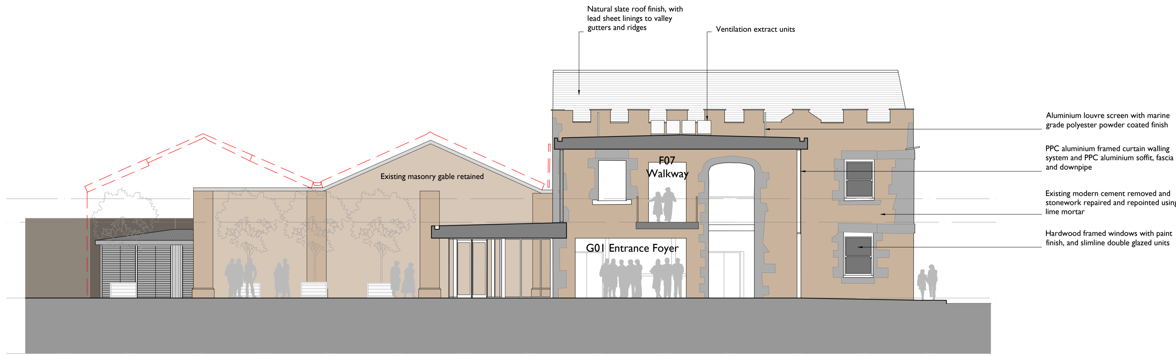
1 2202 Quay Stores North Elevation 1:100