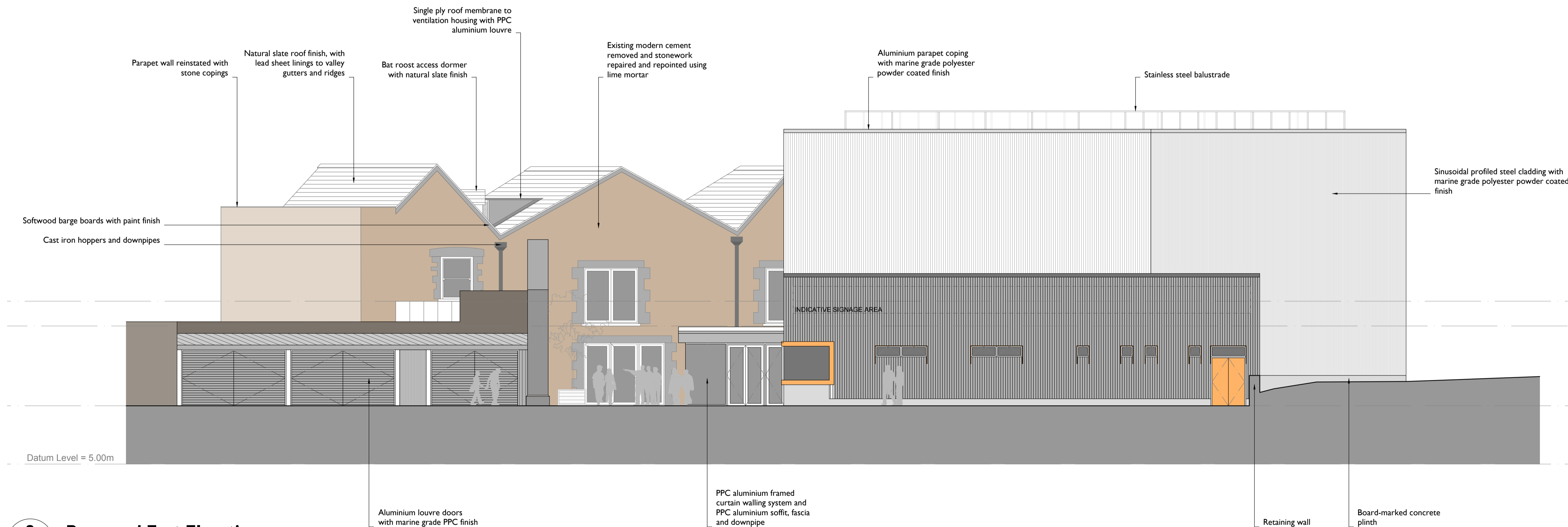
2 Proposed East Elevation 2200 1:100

Notes: Drawings are based on survey data and may not accurately represent what is physically present. Do not scale from this drawing. All dimensions are to be verified on site before proceeding with the work. All dimensions are in millimeters unless noted otherwise. Purcell shall be notified in writing of any discrepancies.