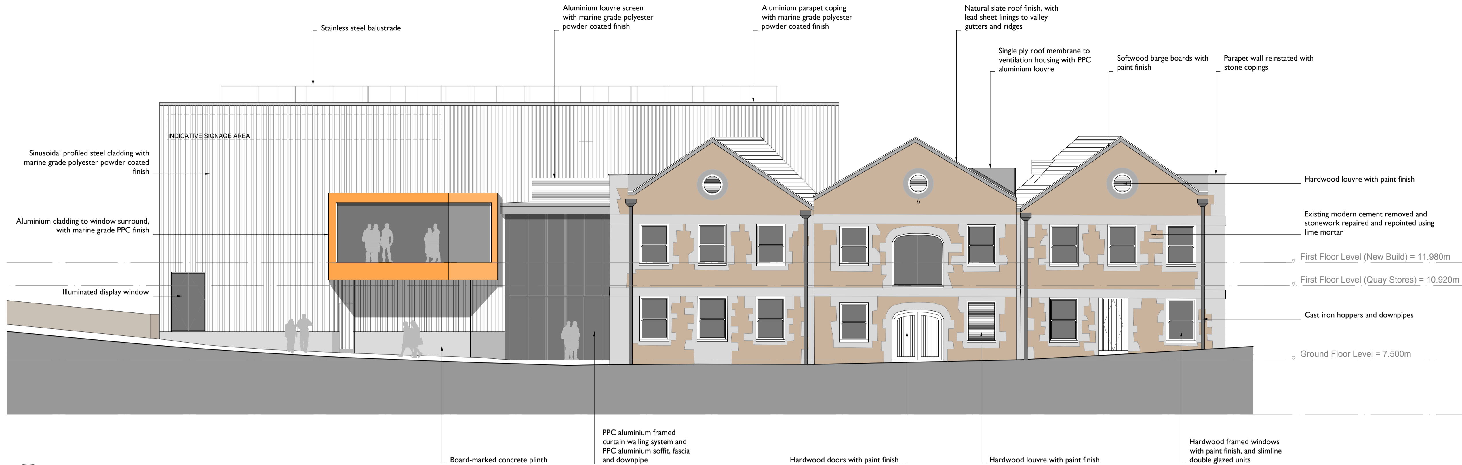
1 Proposed West Elevation 2200 1:100