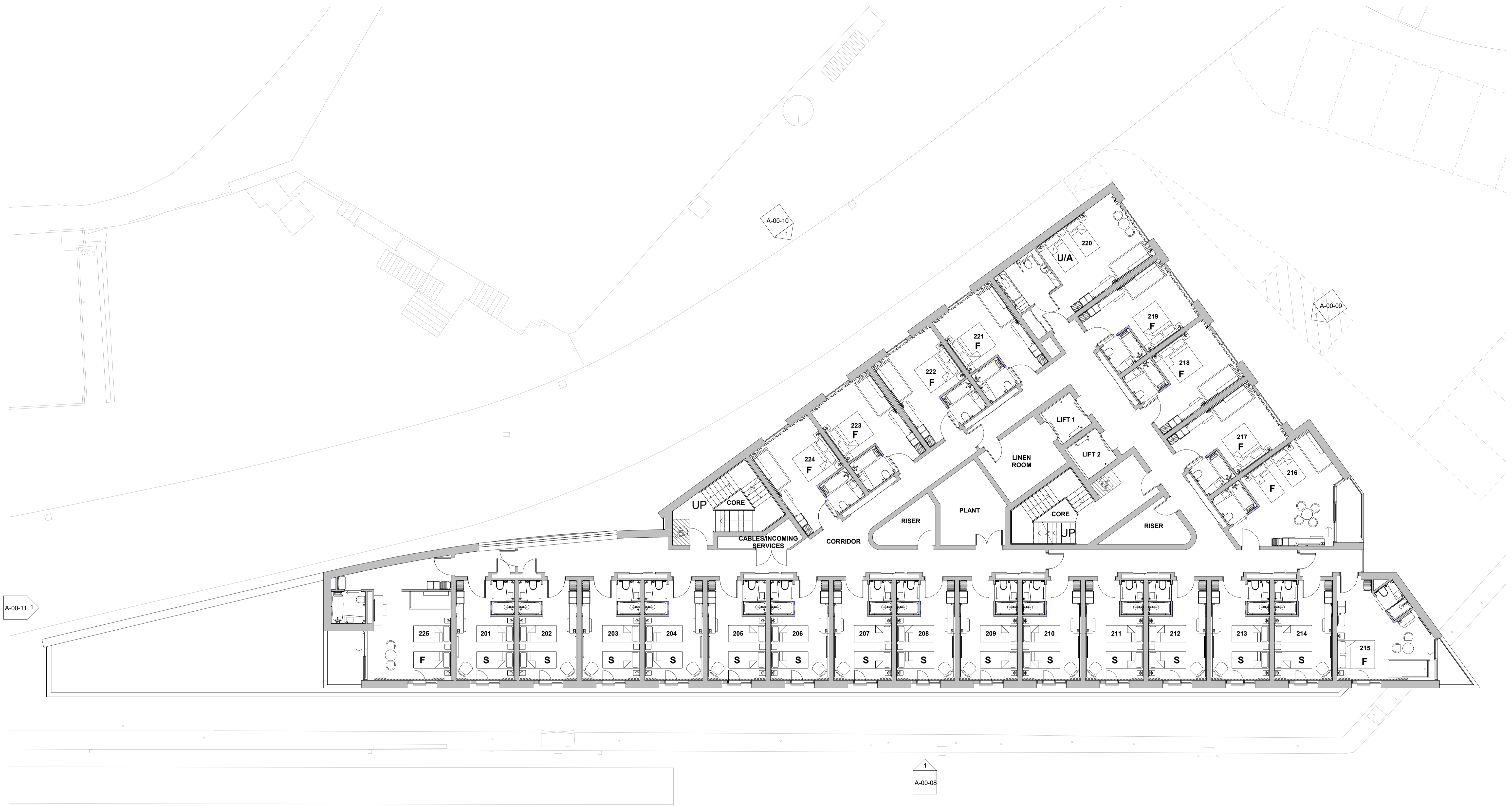
02 - Second Floor Plan 1 : 100